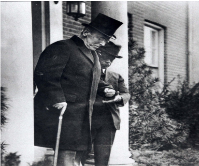
Former President Woodrow Wilson, with the help of an unidentified aide, leaves his Washington home in 1921.